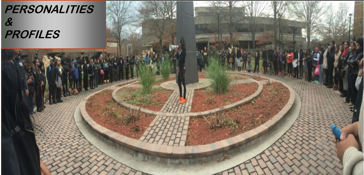
PEACEFUL PROTEST: Students gather on campus (above) before taking to the streets (facing page)