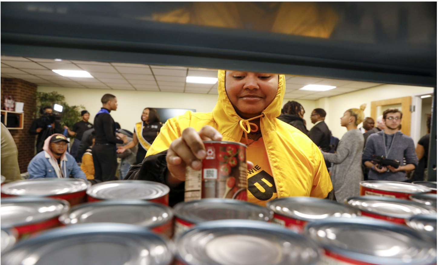
Students shop for groceries, toiletries and non-perishable food items (above and right) at newly opened food pantry and nutrition lounge.